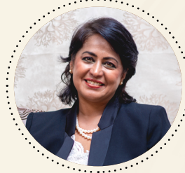
Guest Speaker H.E. Prof. Ameenah Gurib-Fakim Former President Government of Mauritius Reduit, Mauritius