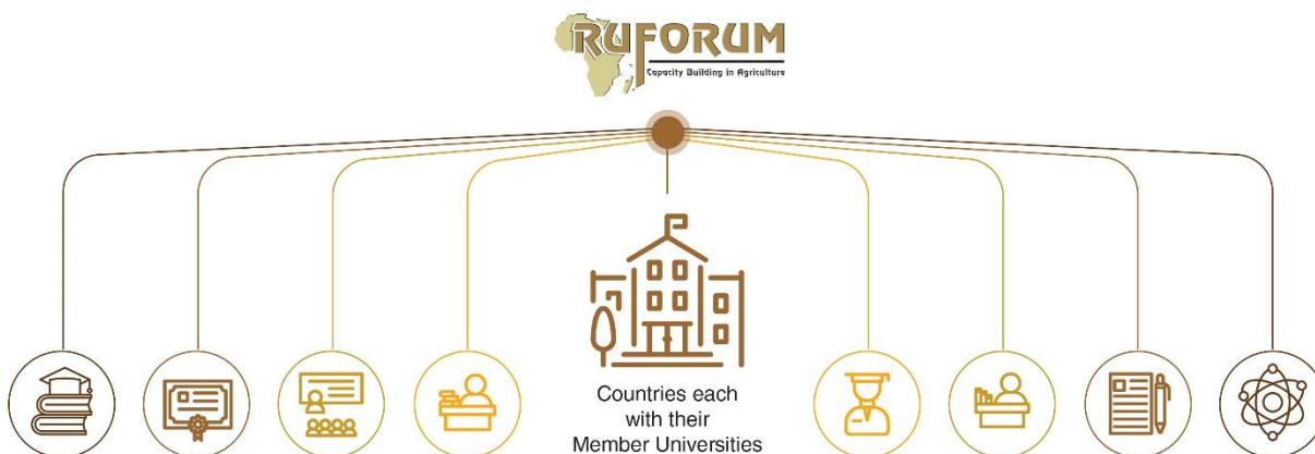
Figure 1. RUFORUM as an umbrella organisation that derives its agenda form its membership.

The Regional Universities Forum for Capacity Building in Agriculture (RUFORUM) is a pan African organization of predominantly agriculture teaching and research universities in Africa. RUFORUM was founded by Vice Chancellors in 2004 and has a member of 163 Universities in 40 countries of Africa for details (see www.ruforum.org ). RUFORUM sees, “ vibrant, transformative universities catalysing sustainable, inclusive agricultural development to feed and create prosperity for Africa ”, as a major mechanism for transforming and growing African economy and global development in general. Since its inception, RUFORUM operations have been based on the vision and mission of its members. To that extent therefore, RUFORUM is established as an umbrella organisation that derives its operational agenda from its members at country level (Figure 1).