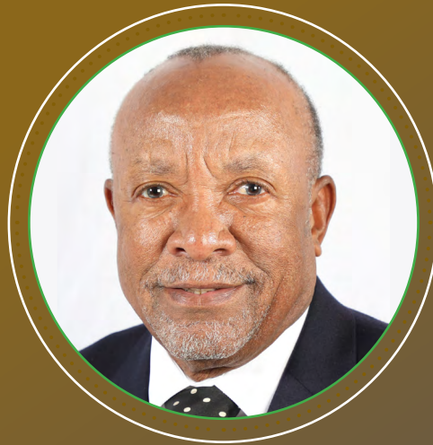
H.E. Dr. Nangolo Mbumba President of Namibia