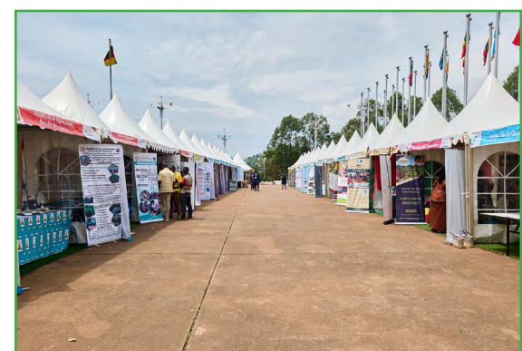
○ Exhibition & Poster viewing