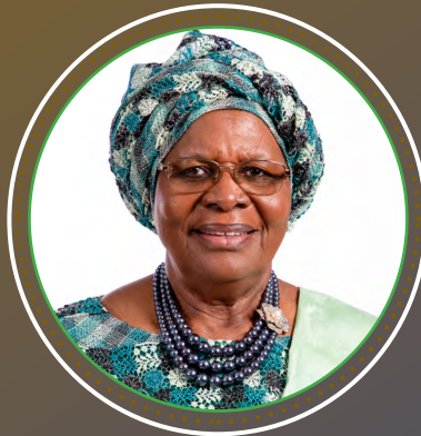
Hon. Dr. Netumbo Nandi-Ndaitwah Vice President of Namibia