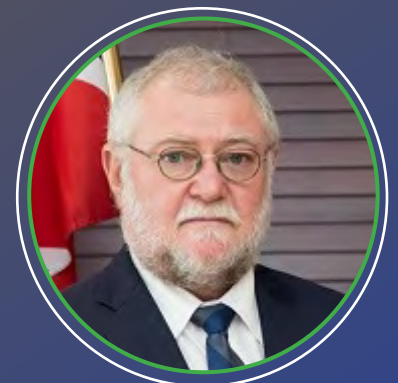
Hon. Calle Hermann Schlettwein Minister of Agriculture, Water and Land Reform