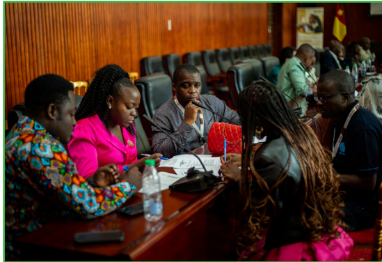
○ Pre-conference Events