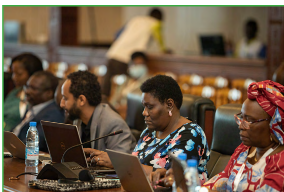
○ Scientific Sessions