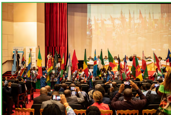
○ Main Conference Events