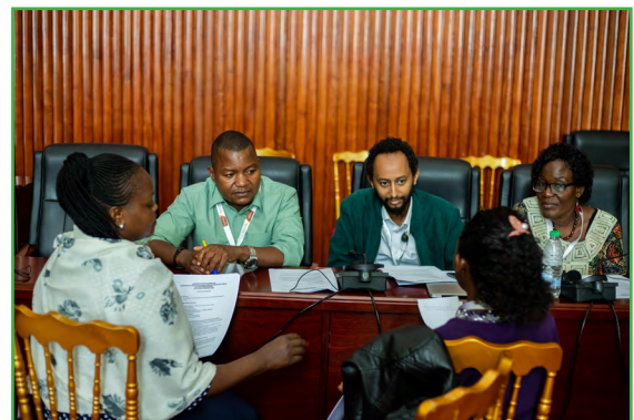
○ Side Events