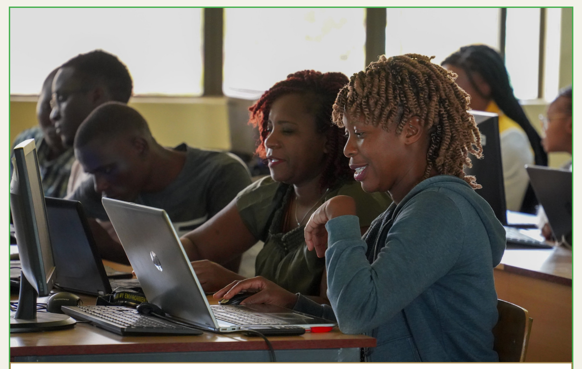
Students in one of the R-Programming sessions during the RUFORUM Annual General Meeting and Scientific Conference in Harare, Zimbabwe

By embracing agricultural innovation, fostering entrepreneurship, conducting research, strengthening capacity building, and influencing policies, African universities can contribute to transforming the agricultural landscape and creating a prosperous future for the continent.