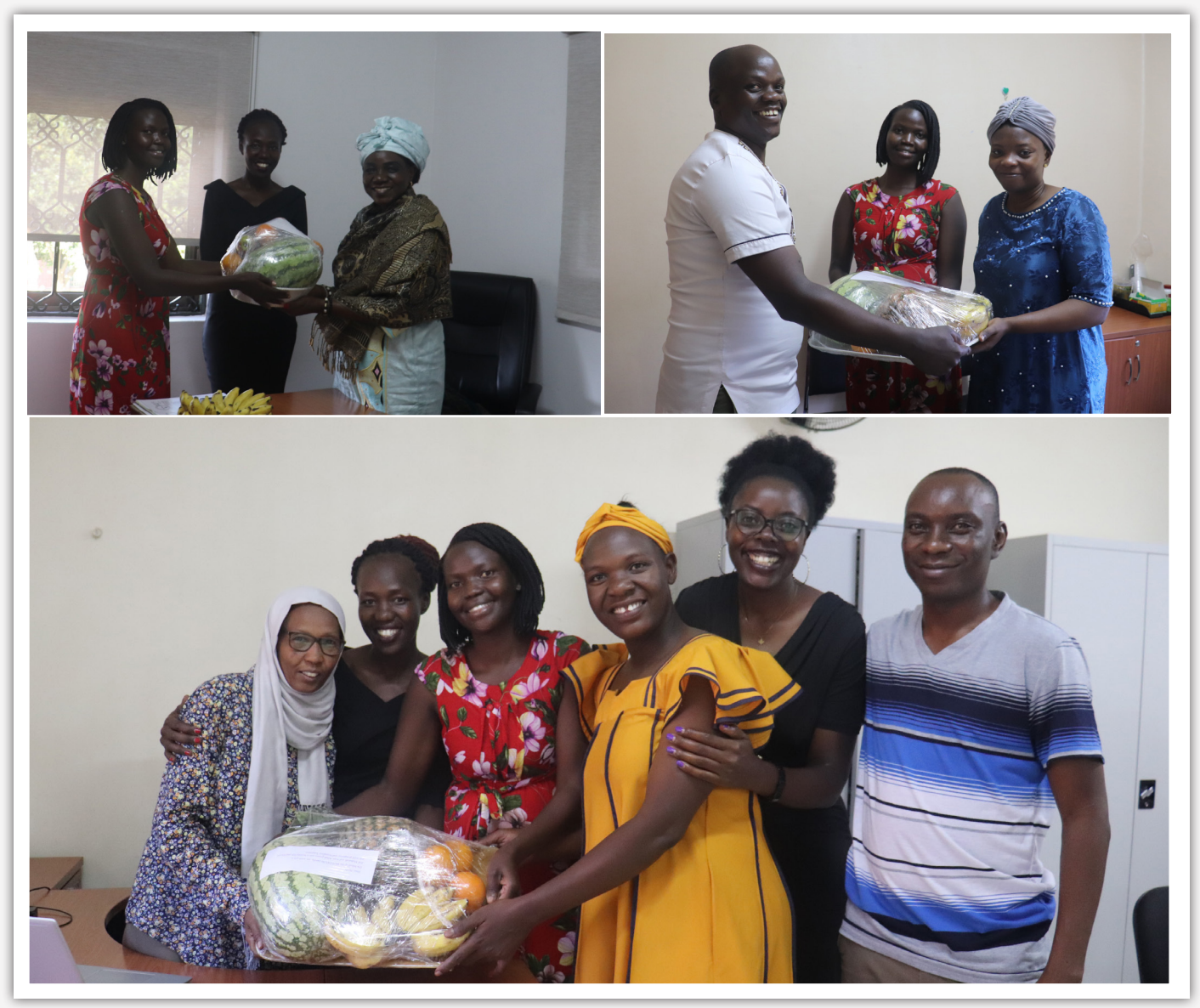
RUFORUM staff handing Eid packages to the muslim staff at the RUFORUM Secretariat, wishing them a happy Eid.