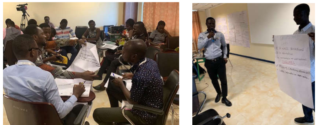
Students engaging in the Thesis Proposal Development, Scholarly Writing and Presentations training