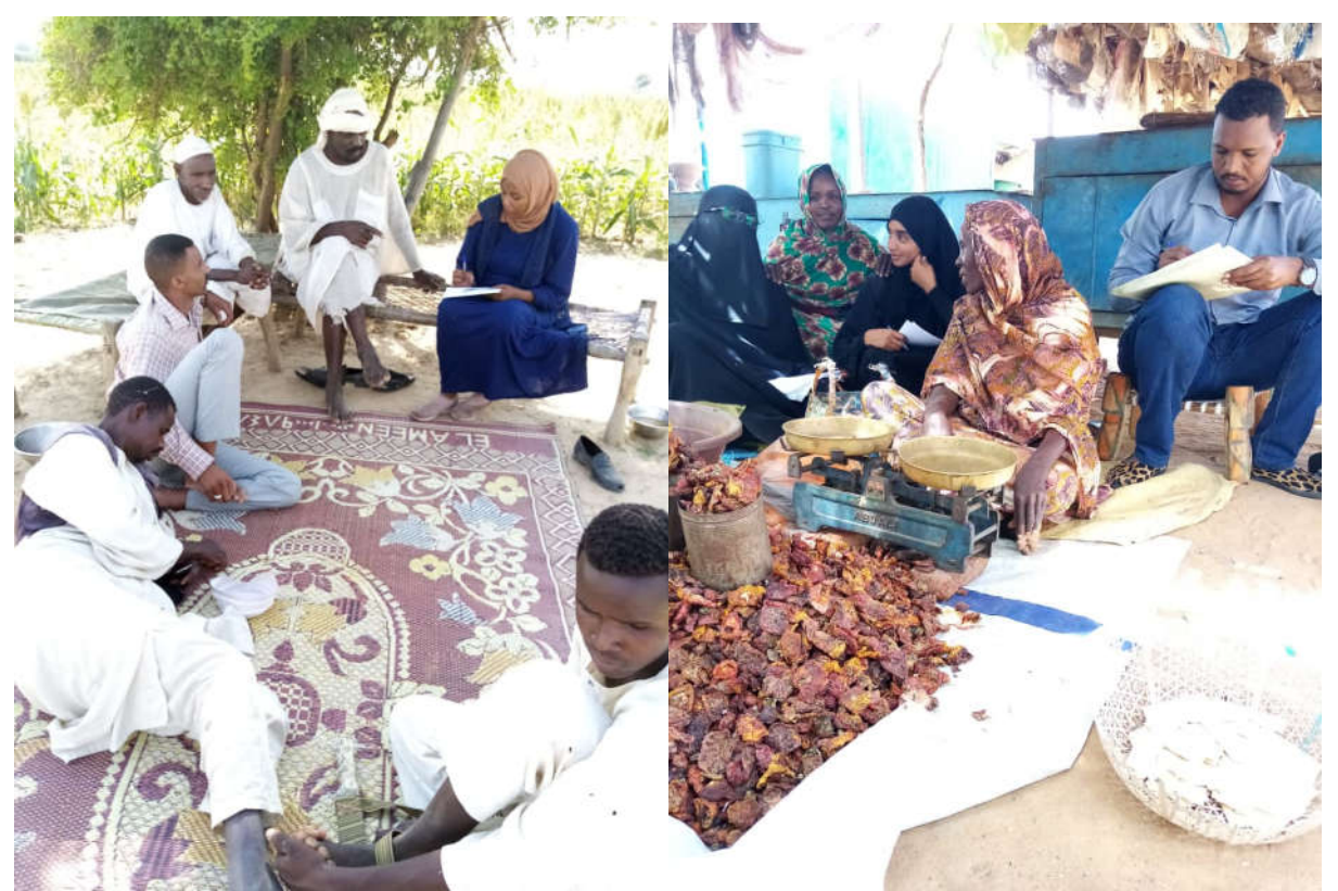
Students undertaking evaluations on indigenous knowledge of the traditional famine-food preparation and availability in North Darfur, Sudan under the vegetable and non-timber CARP

apical rooted cuttings-a departure from the conventional multiplication using tubers, which spreads diseases and pests; and, a seed potato production unit with two crops with the Kenya Plant Health Inspectorate Service (KEPHIS).