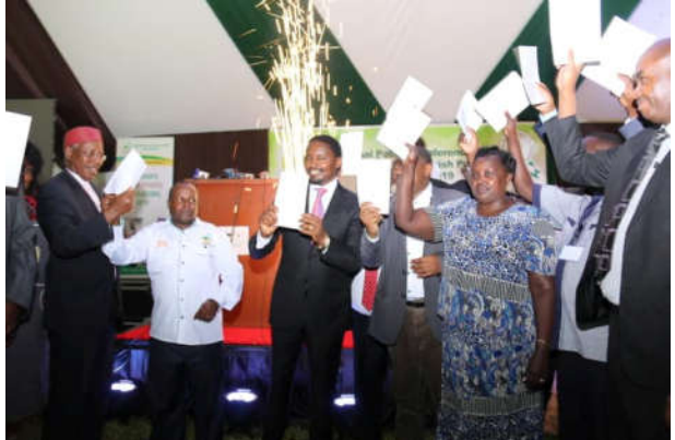
Launch of the Crops (Solanum Potato) Regulations 2019 by Hon. Mwangi Kiunjuri, the CS for Agriculture, Livestock, Fisheries and Irrigation

The Secretariat continued to support implementation of interdisciplinary and multi-agency research in the 16 Community Action Research Programmes operational in Benin (Baobab value chain); Kenya (Cassava, Potato value chains); Uganda (Rice, Pig and Potato value chain); Ghana (Pineapple value chain) –Zimbabwe (Water Harvesting value chain); South Africa (Wool value chain); Botswana (Safflower value chain); -Namibia (encroacher bushes value chain); and, Sudan (Honey Bee, Natural Resources Management, vegetable and non-timber