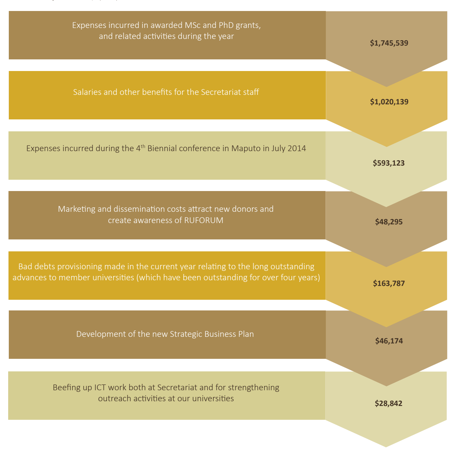
TABLE • STATEMENT OF COMPREHENSIVE INCOME FOR THE 12 MONTHS PERIOD UP TO 30 JUNE 2015