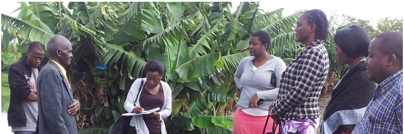
Above: A fish farmer responding to the RUFORUM team during one of the CARP field visits in Malawi

Through the CARPs students have acquired skills and a passion for working at the community level, learning to respect small farmers. A student from Malawi indicated that “Farmers are full of knowledge,