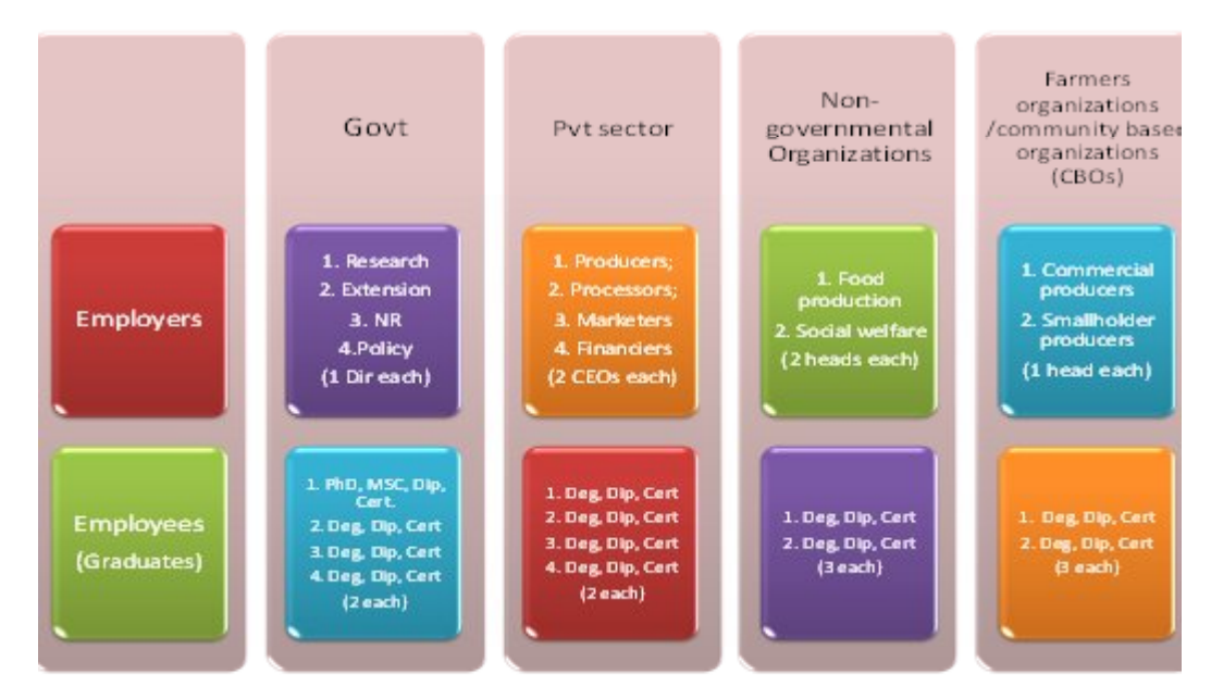
Figure 1. Study sampling frame

The questionnaires were used to collect data in the field. In some cases, one-on-one interviews were conducted. However, most respondents preferred to complete questionnaires at their own time. The completed questionnaires were later collected at a convenient time for analysis. For employees in remote areas, a number of questionnaires were left at their headquarters and the employees completed them on their regular scheduled visits to headquarters. The data collection period was from March to November, 2010.